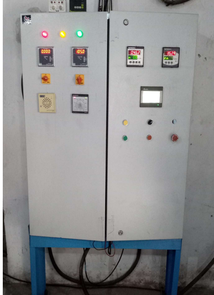
PLC Based Control Panel

3/2 Sua Road, Chandigarh Road, Nichi Mangali, Ludhiana Contact No-+91-7625868681, Email Id-zesttechnic@gmail.com