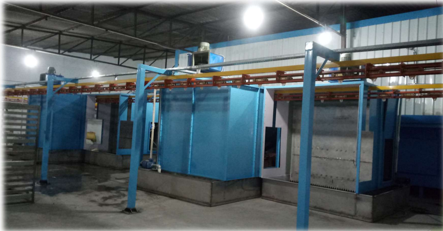
Conveyorized Liquid Painting Plant for E-Rikshaw

3/2 Sua Road, Chandigarh Road, Nichi Mangali, Ludhiana Contact No-+91-7625868681, Email Id-zesttechnic@gmail.com