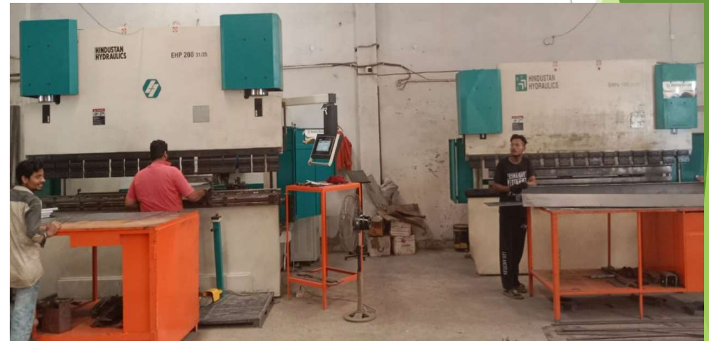
Shearing & Bending Machine

3/2 Sua Road, Chandigarh Road, Nichi Mangali, Ludhiana Contact No-+91-7625868681, Email Id-zesttechnic@gmail.com