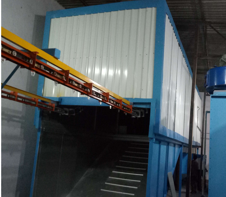
Camel Back Type Baking/Coating Oven