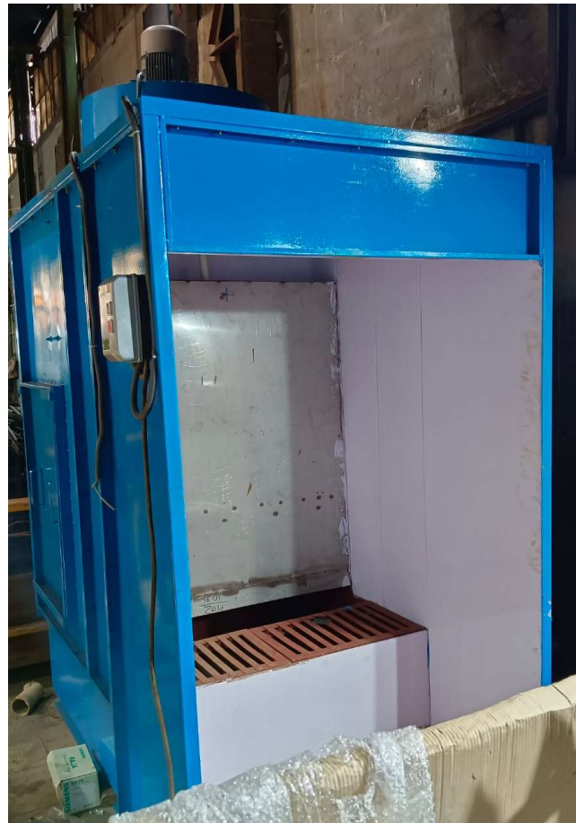
Batch Type Liquid Painting Booth

3/2 Sua Road, Chandigarh Road, Nichi Mangali, Ludhiana Contact No-+91-7625868681, Email Id-zesttechnic@gmail.com